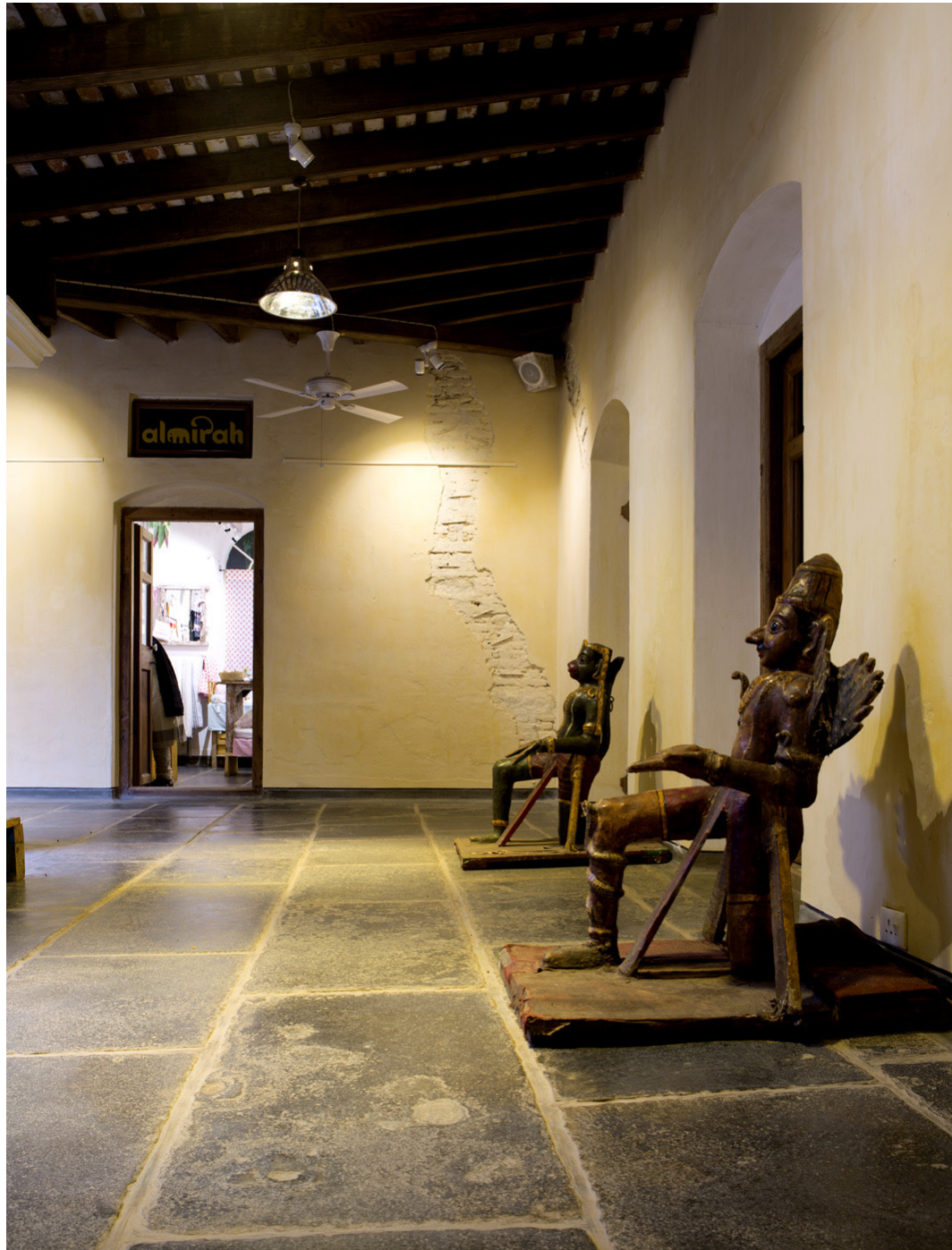
Kadappah stone flooring in the corridor.