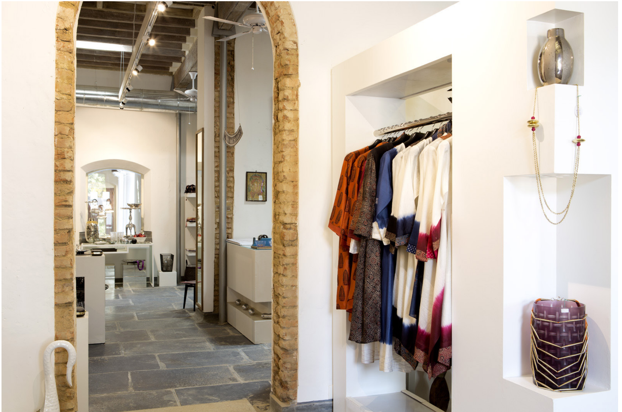
An interior view of the store.