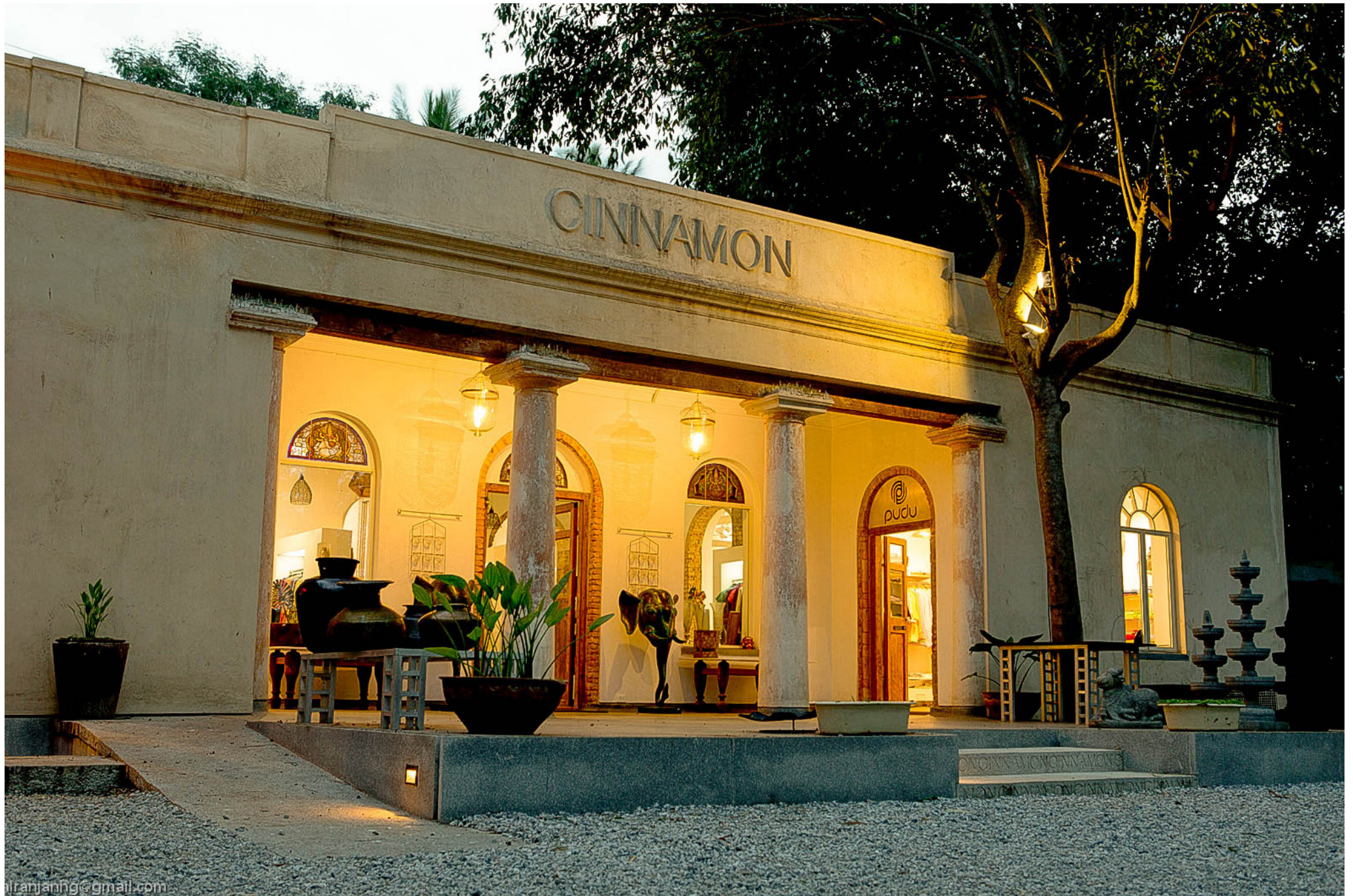
Exterior View - Entrance of the building now marked by a pebbled court.