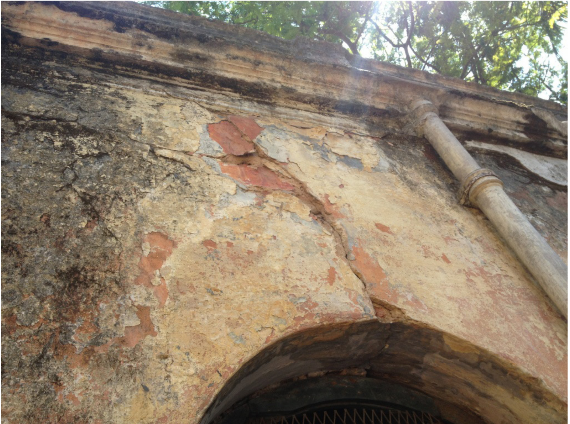
Structural cracks in the arch, now revived.