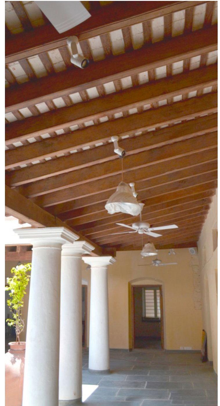
Wooden rafters and purlins for roof of corridor around court.