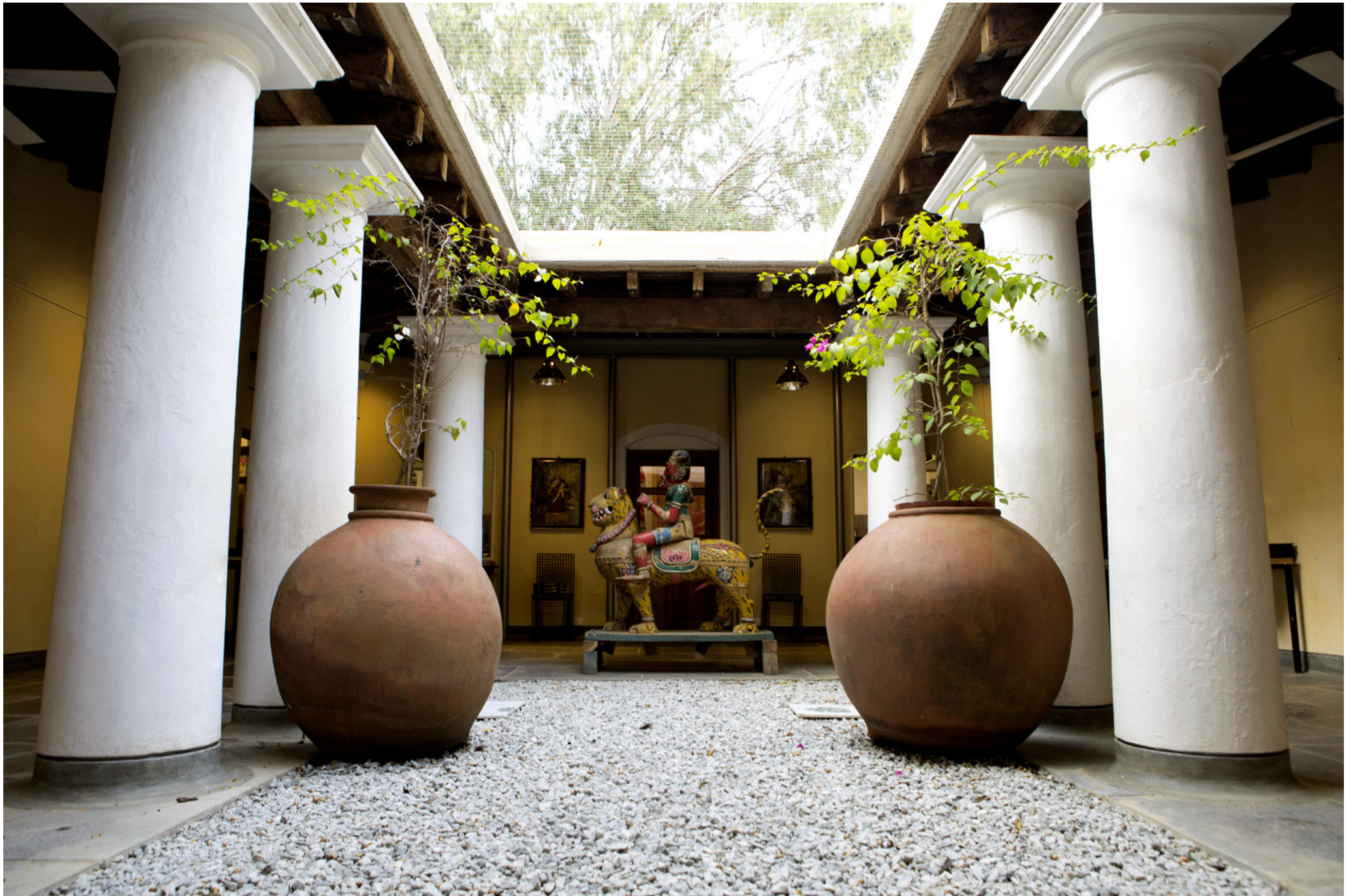
The central court now.