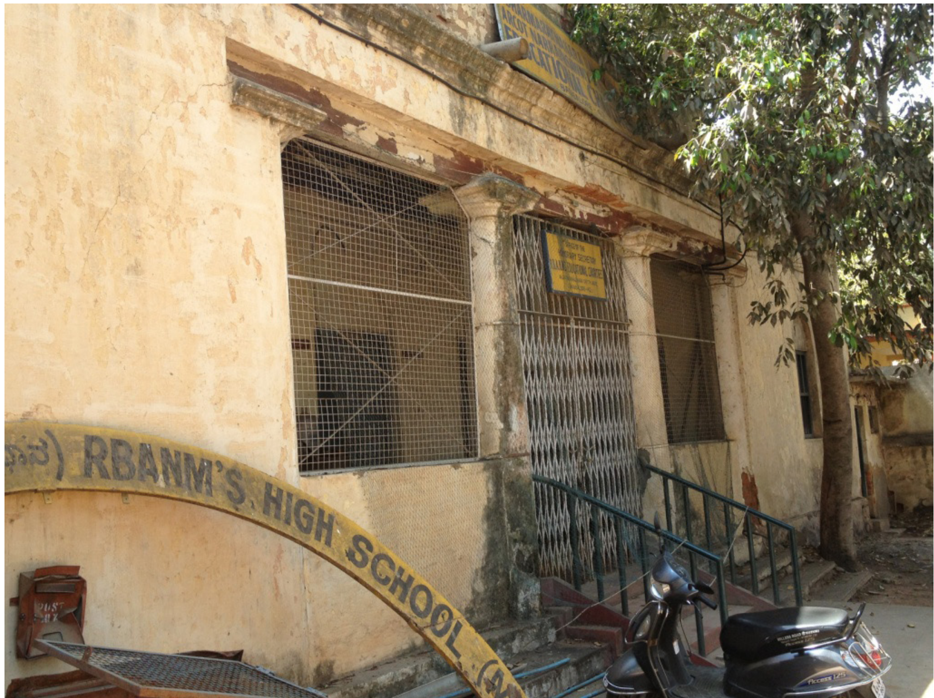
Exterior View - Entrance of the building earlier.