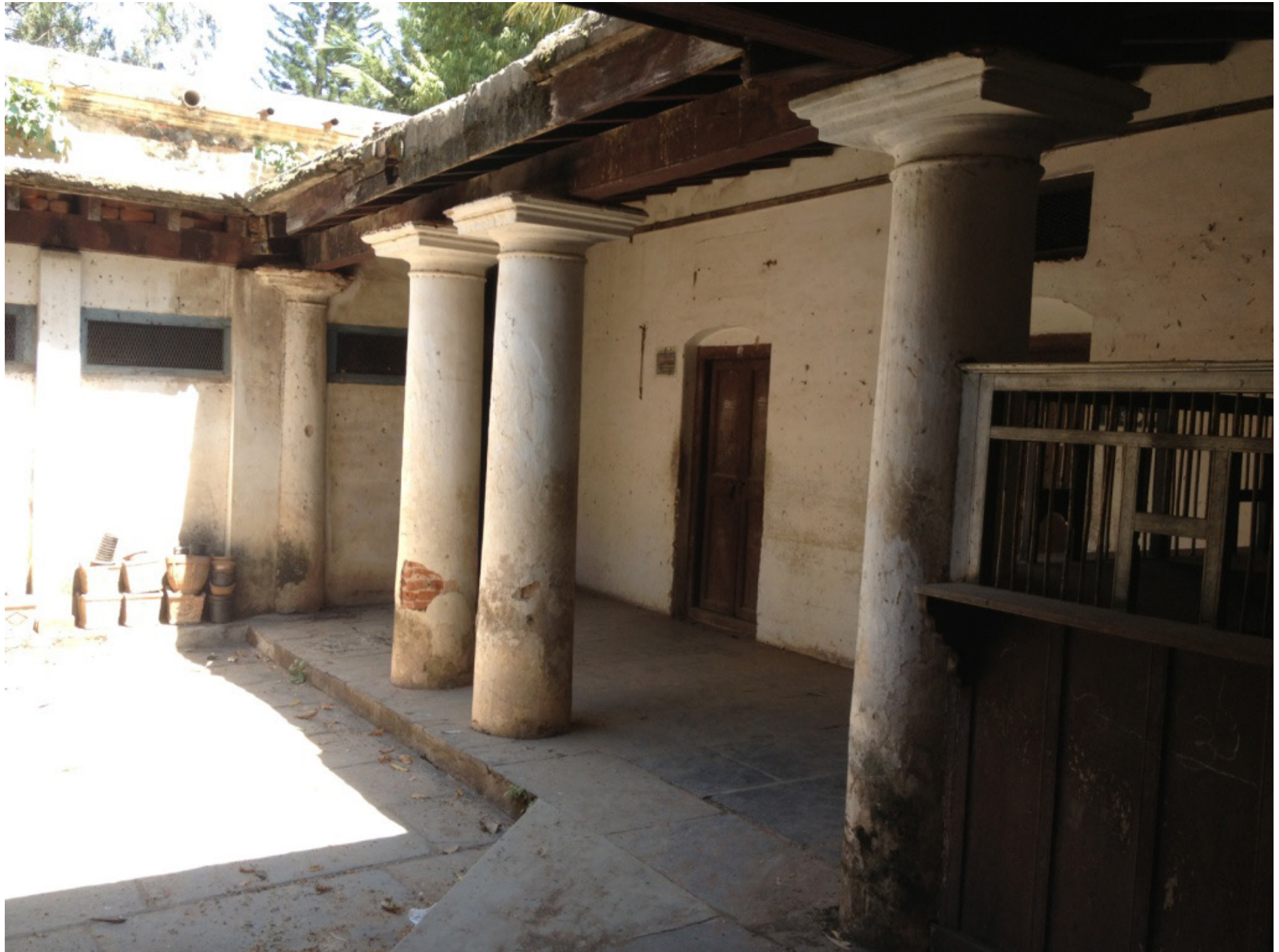
Courtyard and corridor.