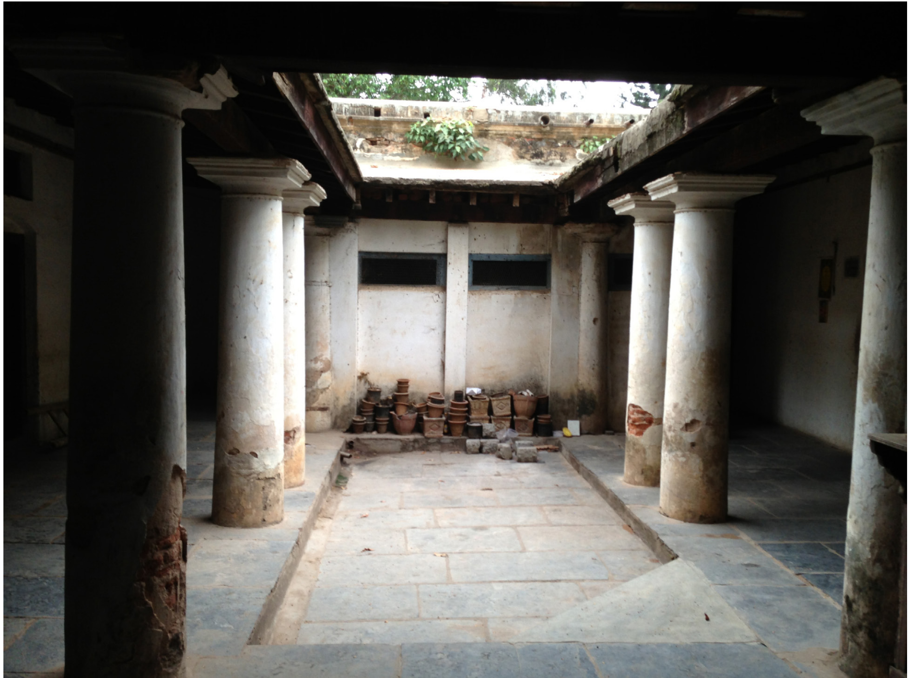
Interior view - View of courtyard as existed.