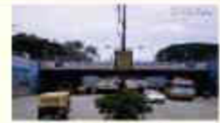
Mekhri Circle Underpass