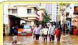
Flooding in JP nagar

Puttenahalli, Central Silk Board, Bhadrappa layout, Agrahara layout, TATA nagar, Nayandahalli and many other areas of Bengaluru were suffering on account of floods. The government led by Sri. HDK acted very quickly and took measures to prevent further flooding of these areas.