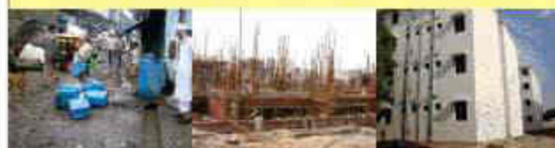
Case of Indira Nagar Slum