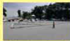
Race Course Road

Race Course Road, Koramangala- Hosur Road, Nrupathunga Road, Nagarabahavi main Road, Palace Road, Jalahalli to Yelahanka road, HAL Airport Road, Thanisandra main road Road to BIAL, Magadi Road, The BJP led BBMP completed 600 mtrs of C.V.Raman Road only. It decided not to widen Roads.