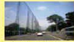
Sankey Road at Golf Course