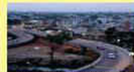
Dommalur Over Bridge