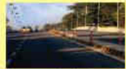
Vijayanagar Grade Separator