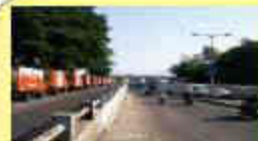
Dairy circle Flyover