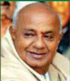
SRI H.D. Devegowda National President Janatha Dal (Secular)

for creating a livable, clean, beautiful & affordable Bengaluru