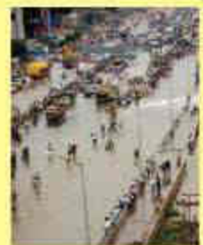
Silk Board Junction Flooding