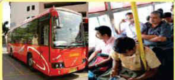
Vajra Buses & Travel Comfort

For the first time BMTC was given State Support to purchase 1000 Volvo buses. This action changed the way BMTC presented itself before the citizens of Bengaluru. These buses provide excellent services especially to Bengaluru International Airport.