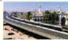
Sirsi Circle Flyover