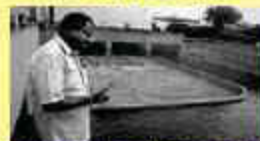
Remodelling of Storm water drain in HSR layout