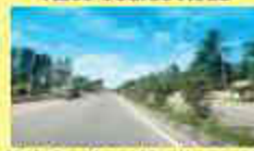
Maj. Sandeep Unnikrishnan Road