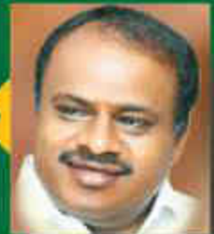
SRI H.D. Kumaraswamy President Janata Dal (Secular)