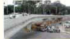
Richmond Road Flyover